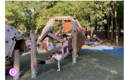
D 190m2 Play space with planting for all age groups (i.e. 0 - 17 years). Surface to be permeable to accommodate roots of existing trees.