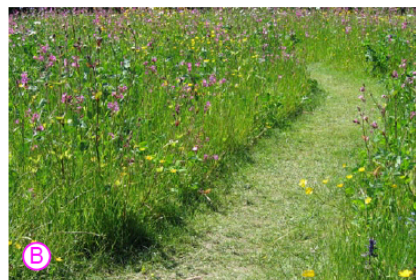
B Area of wild flower and grass created with mown path cut through to create an ecology trail. The majority of existing scrubby vegetation and trees retained, with gaps cut through to allow for pedestrian access.