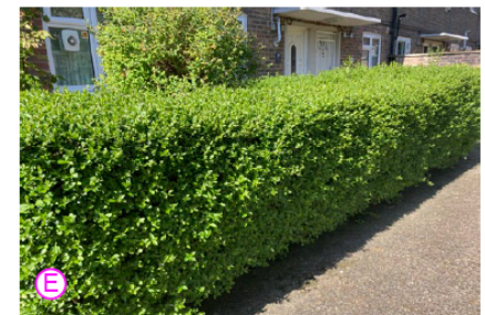
E Native hedge planting to some boundaries.